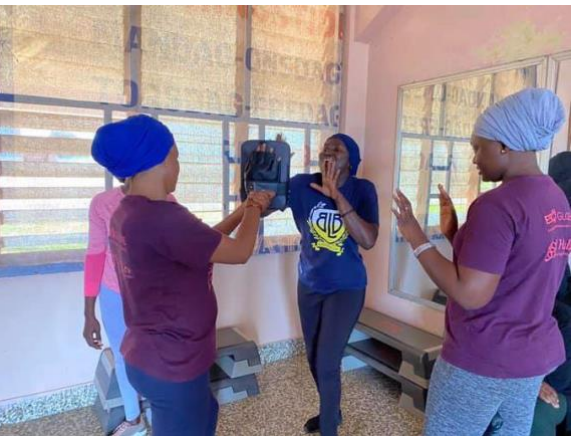
Participants practicing physical techniques