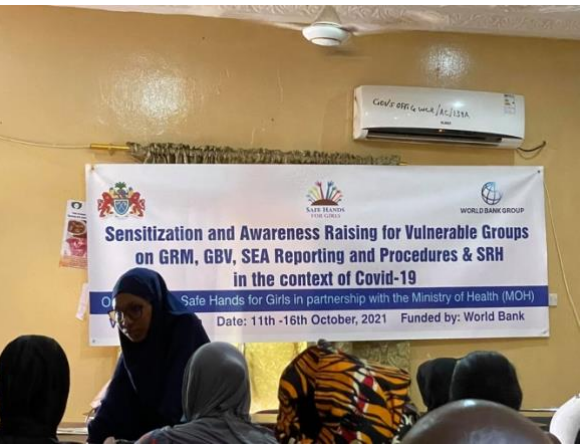
Participants listening to presentations