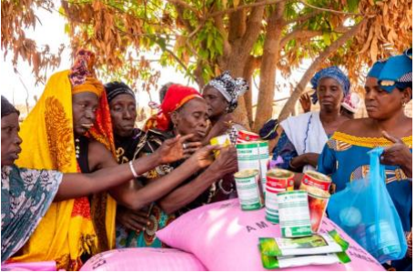
Our founder with some beneficiaries